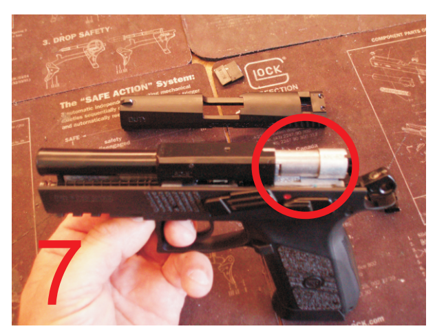
Slide removed and valve-assembly appears