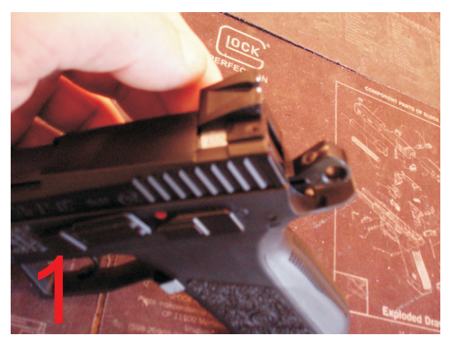
Gently remove rearsight