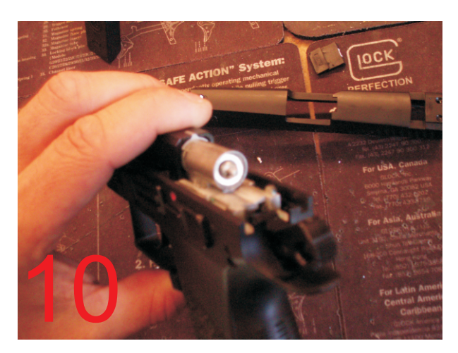
Valve-assembly seen from the back