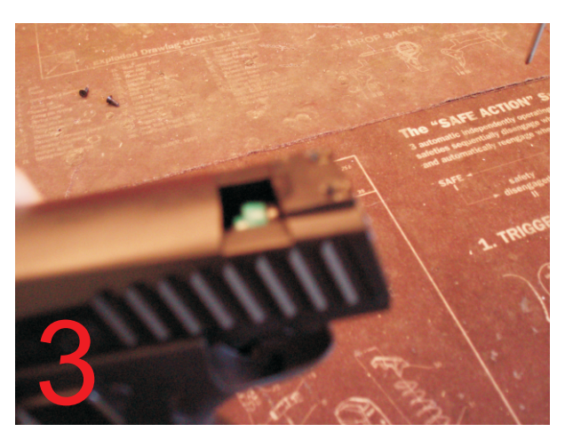
Move slide backwards