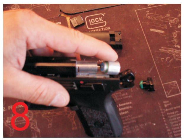
Gently unscrew the end of valve-assembly