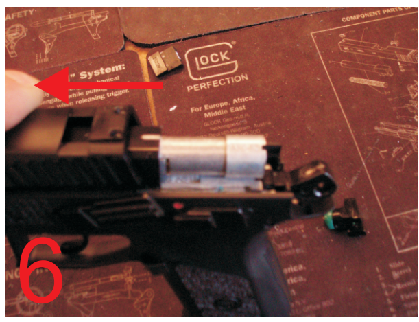
Pull slide off in the shown direction