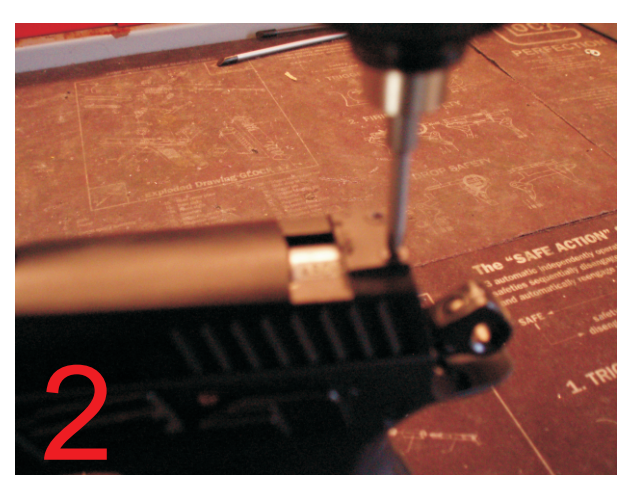
Remove screws from slide